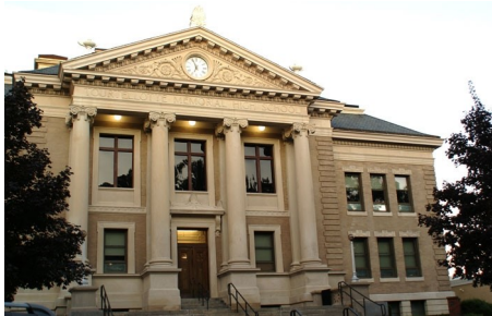
Above: 1909 TMHS building after the 2009 restoration project.

The TMHS 1909 Building and Memorial Room has endured many changes over its century-long life. Over the years, the building slowly transitioned from a vibrant state-of-the-art high school to a neglected underfunded administration building wrought