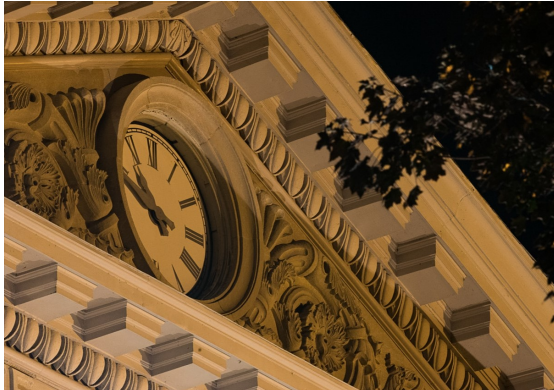
Above: 2015 picture of the Tourtellotte clock.