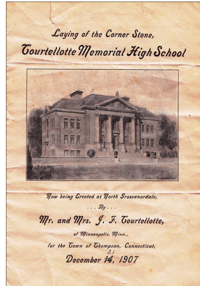
Above: The December 21, 1907 Laying of the Corner Stone Brochure. The original date was set for December 14, 1907, but the weather was too cold and they postponed it until December 21. It turned out to be the greatest Christmas gift the town ever received.